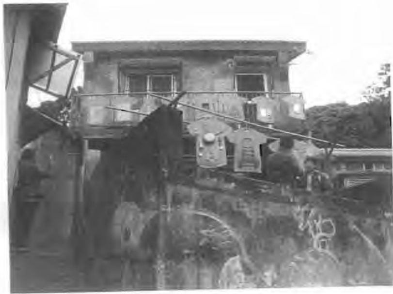
Figure 9.1 Treasure Hill, an illegal settlement in Taipei

Note: With support from many civic organizations, this squatter village was preserved and repurposed as the Taipei Artist Village. Some of the original residents remain, and are permitted to stay for the rest of their lives, but cannot transfer title. (Yi-Ling Chen)