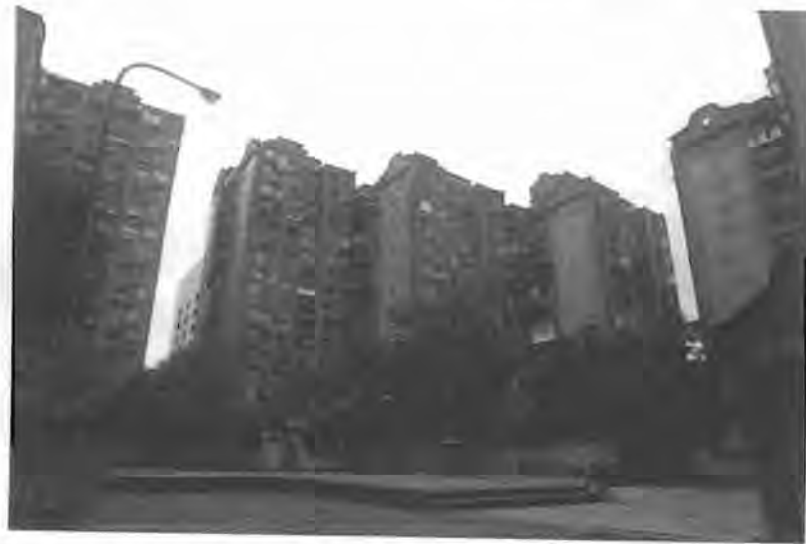
Figure 9.3 Da-An District Public Housing, completed in 1985 under the Six-year Housing Construction Programme

The mid-1970s marked a major change in social policy as well as in housing policy. The KMT government enacted the 'Public Housing Act' in 1975 and incorporated the 'Six-year Housing Construction Programme' (1976-1981) into the national economic plan, aiming to provide 100,000 units of public housing (Figure 9.3). The driving force for this large-scale housing project came not from labour or social movements, but was rather in response to two oil crises and diplomatic isolation (Mi, 1988, p. 113). In 1971 Taiwan lost her seat in the United Nations to China and in 1979 the United States terminated diplomatic relations, leaving the KMT government without a valid claim to sovereignty over Mainland China. Meanwhile, domestic democratic movements emerged to question the legitimacy of the authoritarian state. The KMT state faced a severe confidence crisis, and the situation worsened when the two oil shocks of the 1970s hit Taiwan's import-based, energy-dependent economy. The resulting rapid inflation, combined with rapid GDP growth and an increase in the money supply contributed to a housing boom. Upper-income families, seeking to preserve their wealth in real estate, drove up housing prices so quickly that middle-income people found themselves even less able to afford housing. Introducing the public housing programme therefore served to help the government to restore