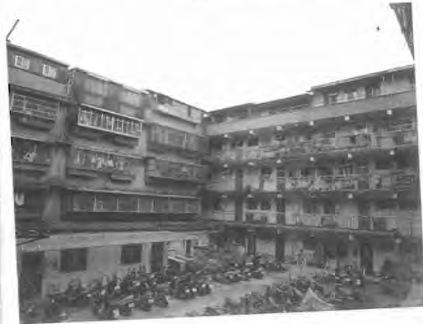
Figure 9.2 Fu-Yuan District Public Housing

In the 1960s, the economic agenda emphasized the development of labour-intensive light industry, shifting from an import-substitutive towards an export-led economic strategy. With economic growth averaging around 9 per cent through the 1960s, Taiwan rose to become a newly industrialized country in the system of the new international division of labour (Hsu, 2011). Rapid urban expansion during this time forced the government to begin improving urban infrastructure, with a small amount of public housing constructed for households affected by urban construction (Figure 9.2). The shortage of urban housing stimulated the development of the housing market and, most importantly, the establishment of private construction companies (Tseng, 1994: 91–96). Without any institutional intervention or financial support from the state, private developers created an informal pre-sale housing system to address the housing finance problem. In this pre-sale